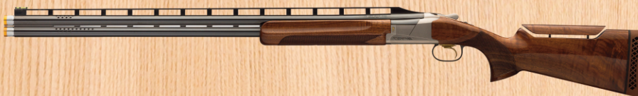
Browning Citori 725 Pro Trap 12 Gauge (MSRP $4,499)

Purchase $100 in tickets and recieve a bonus ticket for a separate drawing